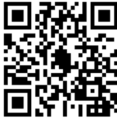
Online platform QR code

Submission time: 7 December, 2023 09:30am – 8 December, 2023